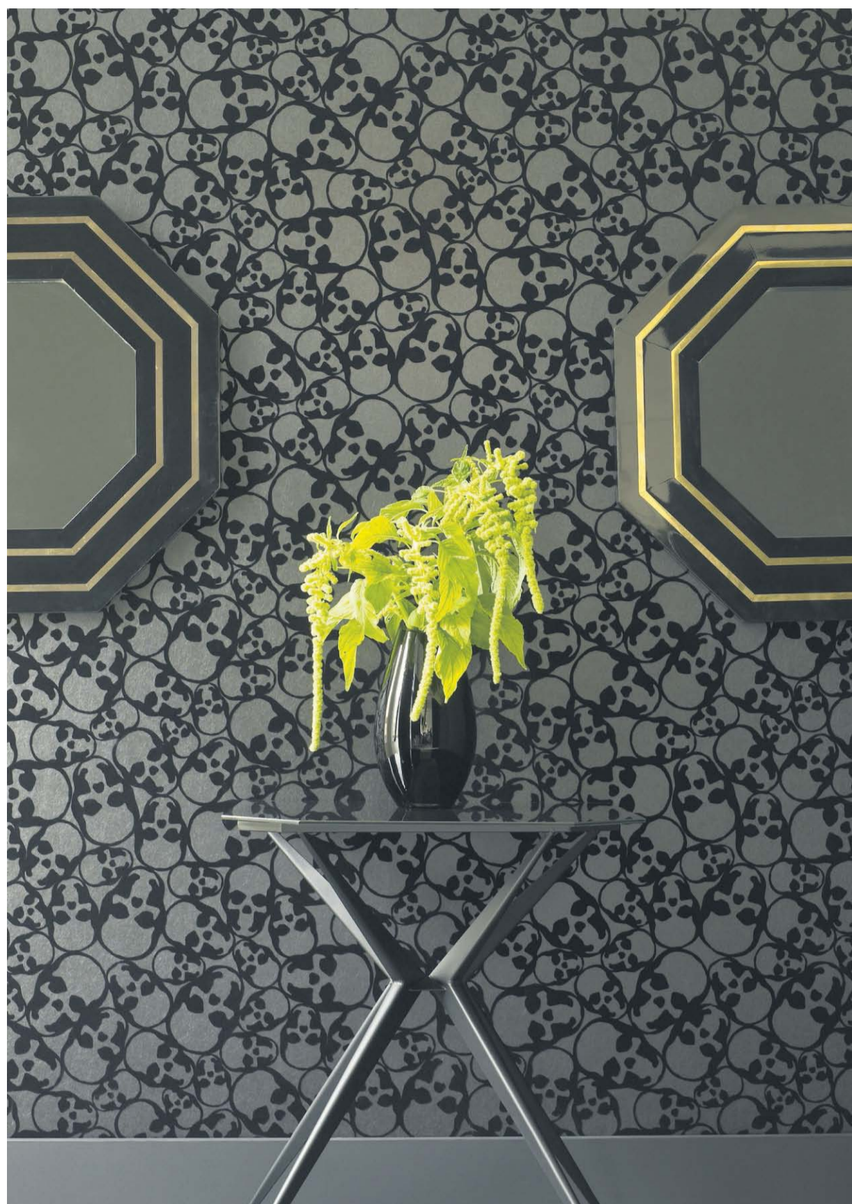
Above, Skulls wallpaper by Barbara Hulanicki for Graham & Brown. Centre, a photograph from Abigail Ahern's 'A Girls' Guide to Decorating', published by Quadrille. Bottom, black furniture, such as this sofa by BoConcept, can be a striking addition to a living space.