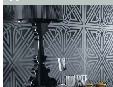
Viva wallpaper Barbara Hulanicki, Dh347, grahamandbrown.com