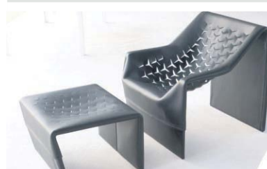
Skin seating by Jean Nouvel for Molteni, Finasi, available to order, price on application, Al Itihad Road, Dubai, 04 297 1777

Matt black works uniquely in rooms large and small – making a small room seem more regal and a larger space more dramatic